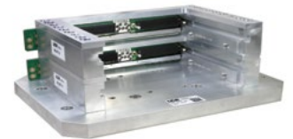
VPX TEST FIXTURES

LCR provides a full line of VPX products and services - everything you need from development to deployment including; COTS rugged application ready chassis solutions as well as custom designs, custom 6U VPX backplanes supporting the latest slot profiles plus development tools including load boards and test fixtures.